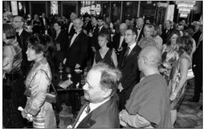
Dinner guests listen to a brief salute to Sir Edmund given by Sir Edmund's grandson.