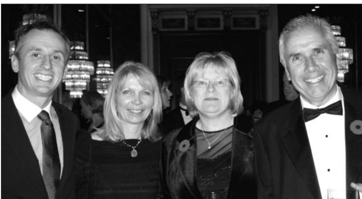
TORONTO GALA DINNER Guests at the Toronto Gala