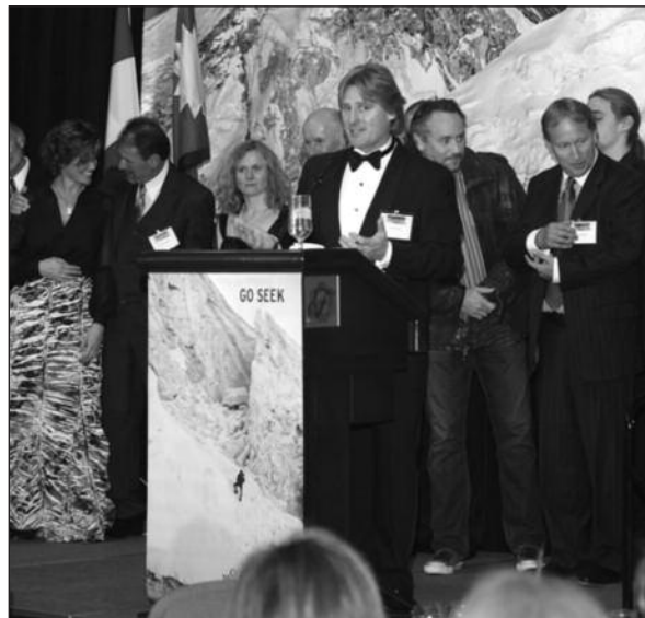
CALGARY GALA DINNER The Calgary Tower Rappel Team who rappelled down to raise funds for the SEHF. It will now be an annual event for our Foundation.