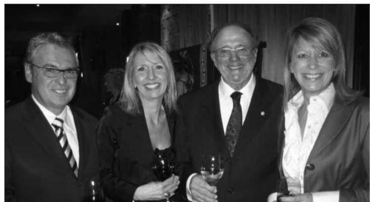
MONTREAL GALA DINNER Guests enjoy Montreal gala evening