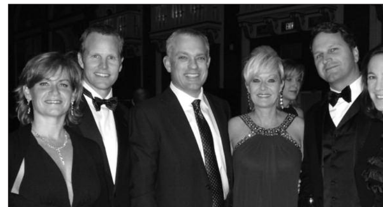
TORONTO GALA DINNER Guests at the Toronto Gala